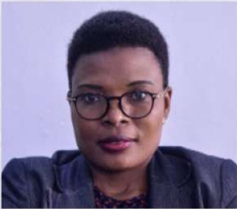
Milka Chief Executive Officer