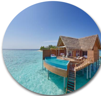
Privacy & Exclusivity