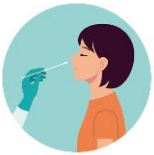
Negative PCR results