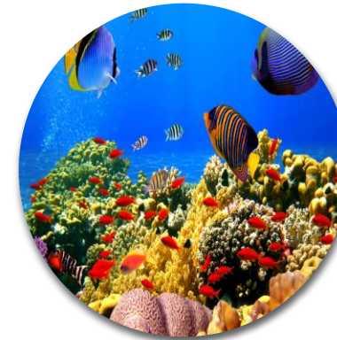
Rich Marine Life