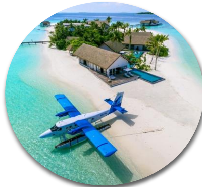
One Island, One Resort