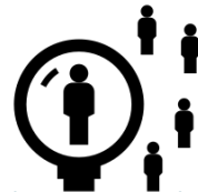
Random sampling at resorts