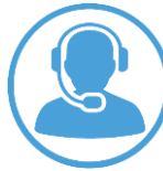
Helpdesk @ Airport