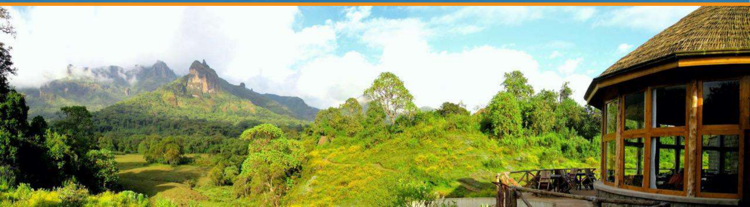
Bale Mountain Lodge a concession in Bale Mountain National Park, Ethiopia