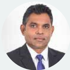
H.E. Mr. Faisal Naseem Vice President of the Republic of Maldives