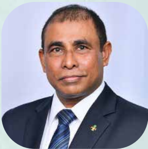
Dr. Abdulla Mausoom Minister of Tourism, Maldives

I hope this Summit would be a platform through which tourist destinations can learn and share our experiences with one another on how to make tourism more sustainable, resilient to climate change, and beneficial for local communities. I look forward to welcoming you all to the Maldives and participating in this Summit.