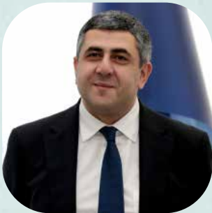
Mr. Zurab Pololikashvili Secretary-General, UNWTO

I look forward to welcoming you to the Maldives to attend the Global Summit on Community-based Tourism, one of the key events of the Maldives Golden Year of Tourism.