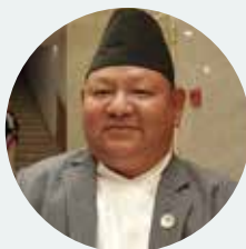
H.E. Mr. Prem Bahadur Ale Minister of Culture, Tourism & Civil Aviation, Nepal