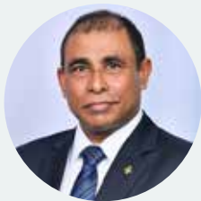
H.E. Dr. Abdulla Mausoom Minister of Tourism Maldives