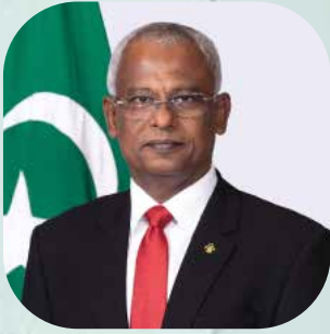
H.E. Ibrahim Mohamed Solih President of the Republic of Maldives

As we are celebrating the 50th anniversary of Maldivian tourism, I am extremely pleased that we are hosting the UNWTO Global Summit on Community-based Tourism in the Maldives. This year, for the first time, Maldives started a home-stay tourism initiative. Guests can now stay at the homes of local Maldivians where they can enjoy authentic local cuisine, learn the culture and traditions of us Dhivehin, and most importantly contribute meaningfully to the local economy at a community level.