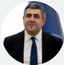
Mr. Zurab Pololikashvili Secretary-General of UNWTO