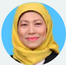
YB Dato' Sri Hajah Nancy Shukri Minister of Tourism, Arts and Culture, Malaysia