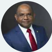
H.E. Mr. Abdulla Shahid President of the 76th Session of UN General Assembly