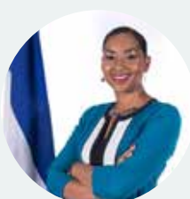
H.E. Ms. Anasha Campbell Minister of Tourism Nicaragua