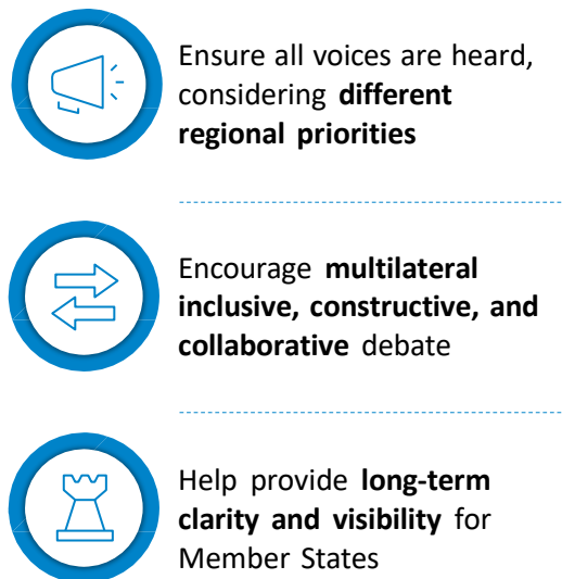
Figure 2. Chair's Guiding Principles

Hence, as Chair of the 2023 Executive Council, I am here to serve the UNWTO, and Member States' priorities based on the following guiding principles: