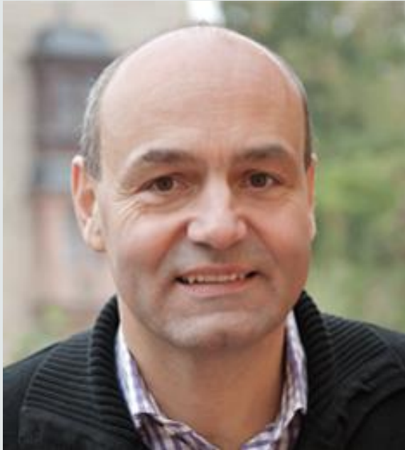
Rowald Hepp Schloss Vollrads